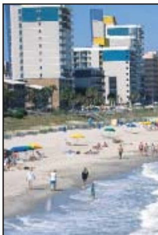
Myrtle Beach, South Carolina

Get more from your meeting—register for a