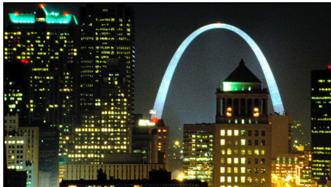
The 2006 ACCP Annual Meeting will be held in St. Louis, Missouri, Thursday, October 26 through Sunday, October 29.

Mark your calendars for ACCP’s 2006 Annual Meeting Thursday, October 26 through Sunday, October 29, in St. Louis, Missouri. Relocated from the original meeting site in New Orleans, all meeting events will take place at the America’s Center Convention Center, located in the heart of downtown