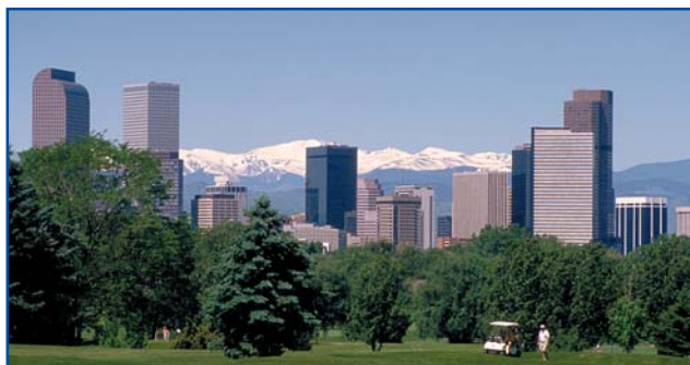
Chart Your Course With Curricular Programming in Denver