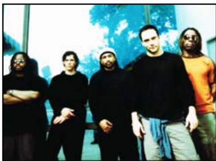
The Dave Matthews Band

The Dave Matthews Band was formed in Charlottesville, Virginia, in 1991. Dave Matthews was a bartender at a local bar. And while he had an interest in music since childhood, he was too shy and scared to perform in front of people. But Dave was convinced by one of his friends to assemble a group of local musicians to record a demo tape with his songs. Over the next 2 years, the Dave Matthews Band played live gigs at local clubs in Charlottesville. The demo tape never landed them a big label contract but they had a great local following. It wasn't until late 1993 that the band had the opportunity to record its first