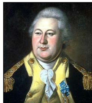
Henry Knox