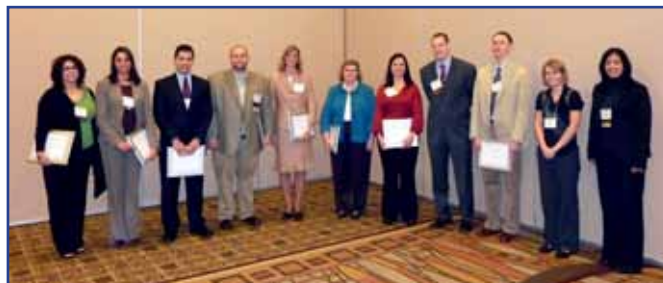
Graduates of the Teaching and Learning Certificate Program who were in attendance at the 2009 Annual Meeting.