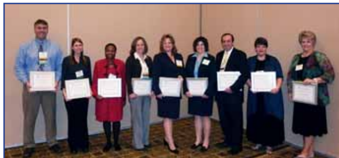
Graduates of the Leadership and Management Certificate Program who were in attendance at the 2009 Annual Meeting.

In addition to these graduates, ACCP would like to recognize and thank those who have served as faculty for Academy courses, as well as the mentors selected by these graduates. The Academy certificate programs are designed to provide both professional and personal growth in one's selected areas of study. ACCP congratulates these professionals on their hard work and dedication and wishes them success in their efforts toward improving the care of the patients we serve.