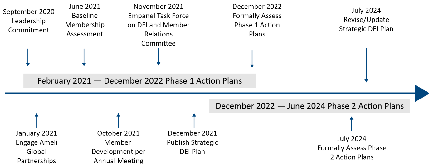
Figure 2. DEI Plan Implementation and Monitoring Timeline