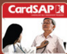
CardSAP Blood Pressure Disorders and Practice Management