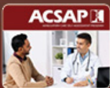
ACSAP Gastrointestinal and Nutrition Care