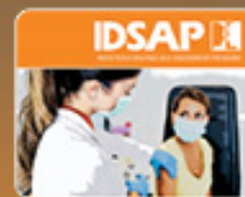
IDSAP Global Public Health Issues